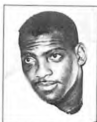
JOHN HENRY JOHNSON

The induction of Joe Greene and John Henry Johnson into the Pro Football Hall of Fame this year marked the first time since 1969 that a Steeler has been inducted into The Hall. It is expected to be the beginning of a parade of former Steelers, however, as several players from the Super Bowl teams of the 1970s become eligible in the next few years.