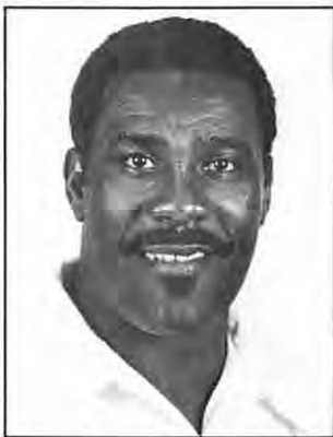
JOE GREENE Defensive Line Coach